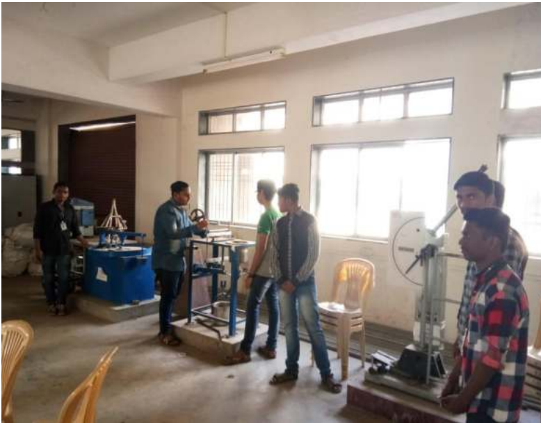
Strength of Material Lab