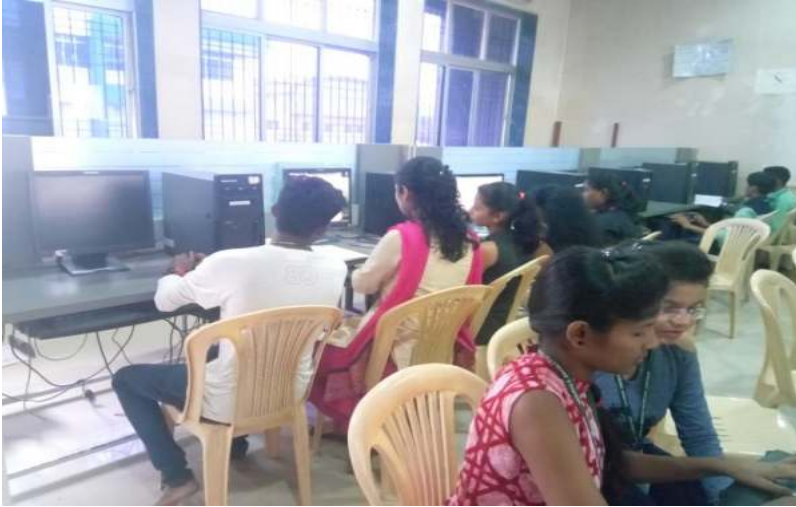
Information Technology Lab