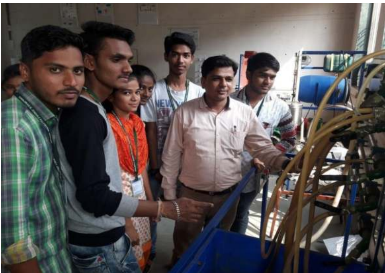
Fluid Mechanics Lab