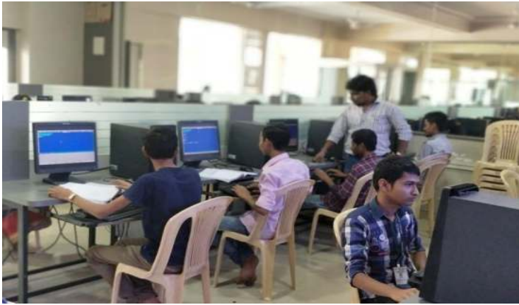
Computer Engineering Lab